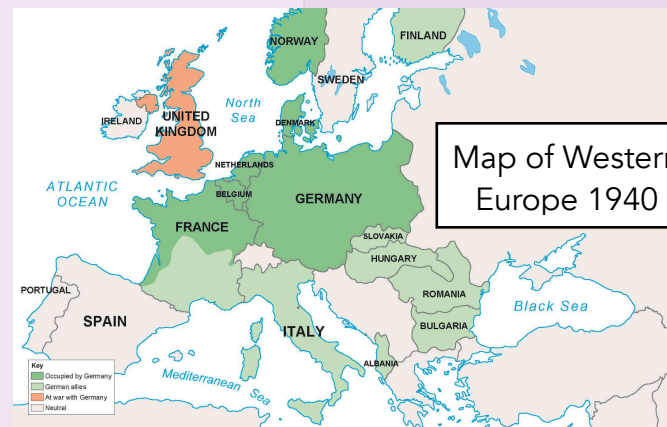
Map of Western Europe 1940