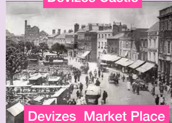
Devizes Market Place