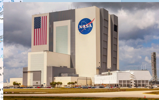
Kennedy Space Centre

Concept(s) Place and Locational Knowledge Human and Physical Geographical Knowledge