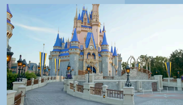
Magic Kingdom Theme Park