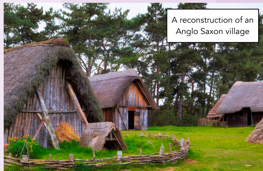
A reconstruction of an Anglo Saxon village